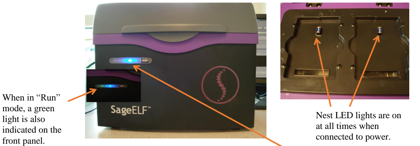
Figure 3.2 Front Panel of the SageELF and cassette nest

After the power button is pressed, the front panel LED will light, and the software will launch.