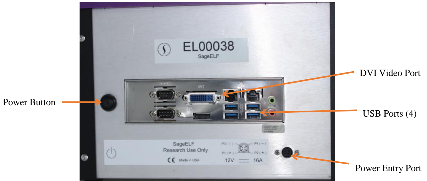
Figure 3.1 Rear Panel of the SageELF